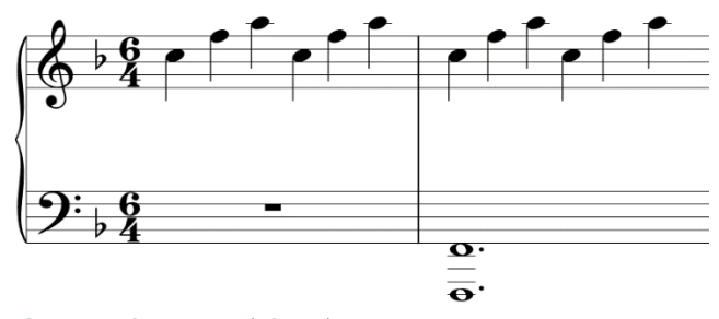
Figure 2: bars 1-2 (piano)

Simultaneously countering and complementing this closed-in quality of the music are elements that give it a more suspended, open quality. Examples are the arpeggiated chords that begin (and end) the piece in the piano. These are second inversion tonic chords, which at the start of the composition are only fully grounded in the second bar with the sounding of the tintinnabular octave tonic F's in the bass (Figure 2):