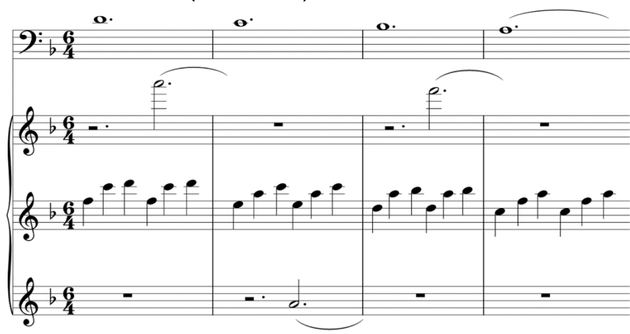
Figure 1: bars 42-45 (cello and 3-stave piano part)

Written in 1978, the piece is an early example of the composer's tintinnabular style, which always combines two different types of voice (Hillier, 1997). One voice – in Spiegel im Spiegel , the cello - moves diatonically in stepwise motion. The other tintinnabular voice – in this piece, the piano – is arpeggiated, with the second tone of each arpeggio always a member of the F major tonic chord. The piano part also includes various other sustained tonic chord tones, sounded in the low, middle and upper registers of the instrument. These sustained sounds have a gentle bell-like (or tintinnabular) quality (Figures 1 & 2). The tonic chord is thus omnipresent throughout, giving the music a closed-in quality that can be associated with the sense of unity or oneness the composer intends in his tintinnabular music (Hillier, 1997).