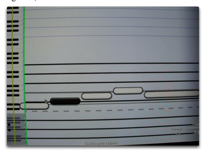
Figure 4: Challenge: Legato in Piano Wizard ^{\rm TM} programme

The process of playing the piano utilises fine motor skills such as finger dexterity and muscle strength to depress individual keys on the piano and bimanual movement such as playing the piano with both hands. As participants progress through the project more attention is given to increasing finger strength and dexterity. The Piano Wizard<sup>TM</sup> software includes etudes for each method book that can be used for finger dexterity exercises. For example an etude for method Book 1 includes only the black notes, as that is what is presented in Book 1, while an etude for Book 2 will include the white notes, as that is what is presented in Book 2. Songs are also played in the challenge mode entitled 'legato' located in the premier mode section of Piano Wizard<sup>TM</sup>, which assists participants with their finger strength. Legato play uses a shape to represent the note value, which encourages an individual to hold a note for the entire note value. This is represented on screen through a shape that moves across the screen similarly to the notes (see Figure 4).