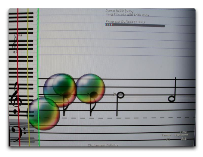
Figure 3: Challenge: Visibility in Piano Wizard<sup>TM</sup> programme

The premier mode of Piano Wizard<sup>TM</sup> contains a challenge setting entitled 'loop', which allows the music therapist to select a portion of the song (hands separate or together) to repeat. This assists the older adult participants with encoding of a new phrase that may provide difficulty; perhaps it is a measure with difficult rhythms or finger patterns. The loop allows for repetitive practice with the accompaniment track. There is also a challenge setting entitled 'visibility', which engages cognitive skills such as retrieval of information and memorisation. Circular shapes randomly cover the music notes that scroll across the screen from right to left (Figure 3).