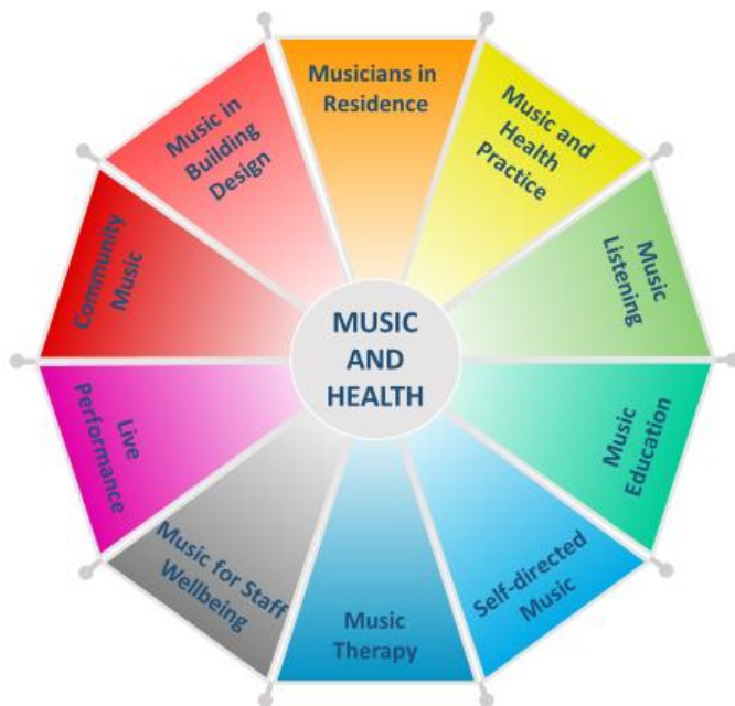
Figure 1: Music and health (Moss, 2016)

This paradigm aims to counter the artificial and defensive barriers constructed between practitioners and professional groups within the field, encourages greater respect and understanding between practitioners and assists in identifying training and development needs for the various arts professionals working in contexts related to health and well-being.